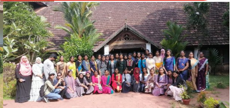
Lulu Mall, Trivandrum ✨