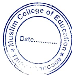
Principal Muslim College of Education Thiruvithamcode