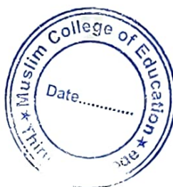
Principal Muslim College of Education Thiruvithamcode